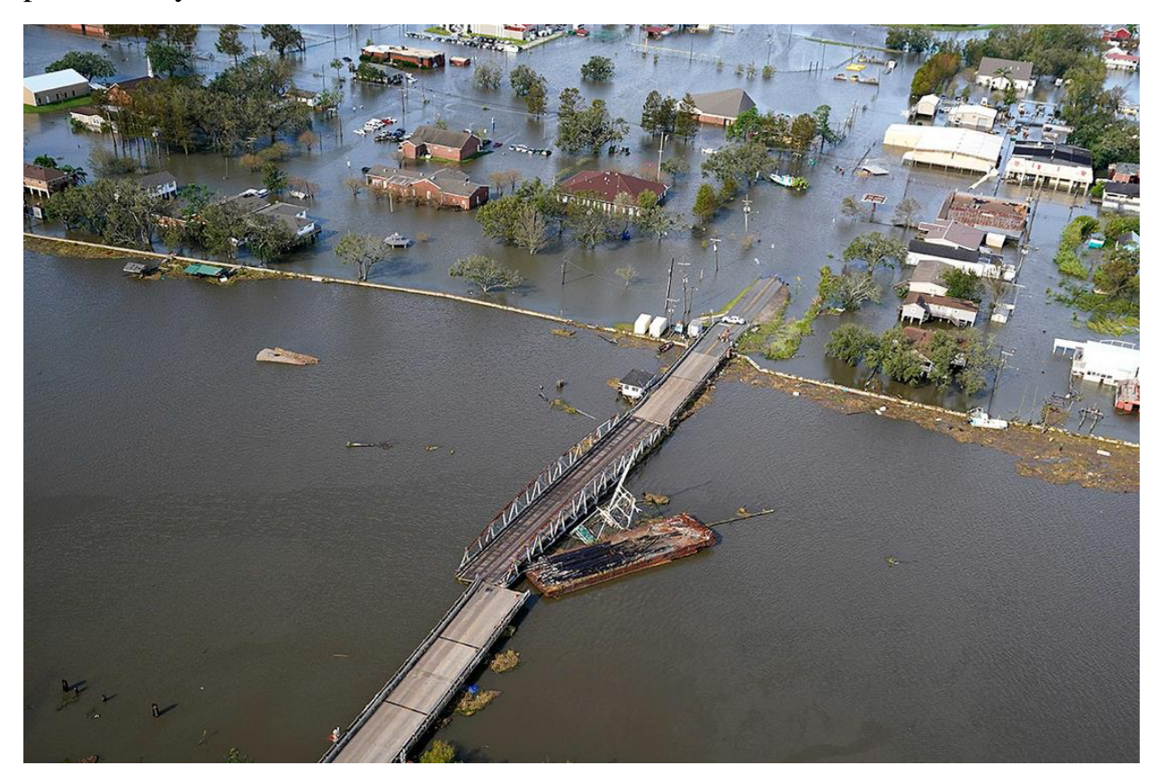
Impact of the Hurricane Ida. Photo Courtesy of Daniel Cusick and Hannah Northey, E&E News / 09/01/2021

storm displaced more than 1 million people at its peak and more than 400,000 people permanently.