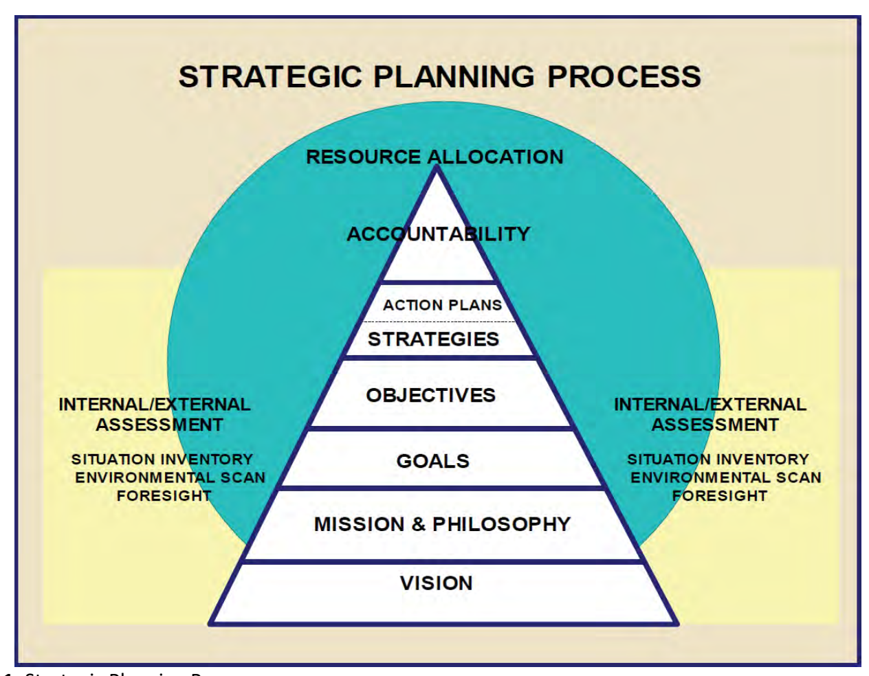
Figure 1. Strategic Planning Process

Figure 1 reflects the strategic planning process that included internal Strengths Weaknesses Opportunities and Threats (SWOT) Analyses, External Environmental Scans, and Stakeholder Surveys.