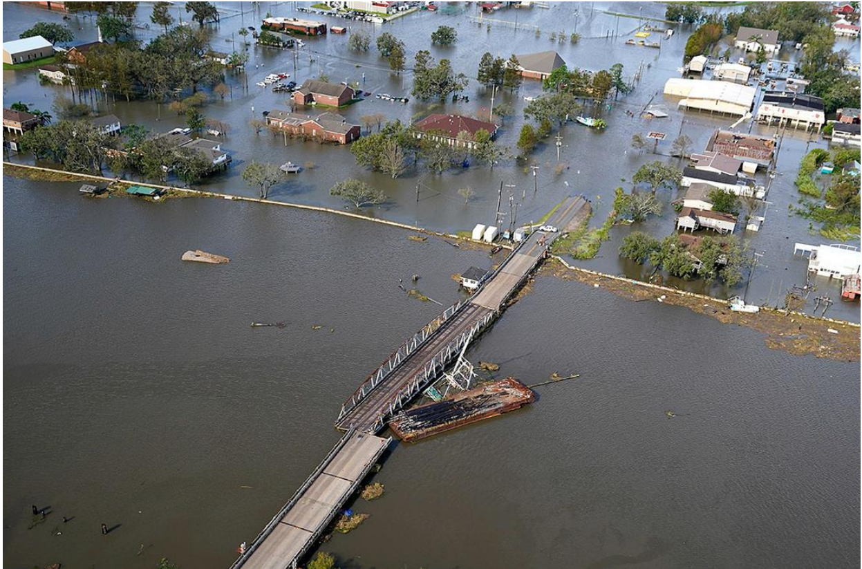
Impact of the Hurricane Ida. 09/01/2021

storm displaced more than 1 million people at its peak and more than 400,000 people permanently.